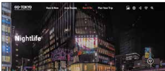
<GO TOKYO, the official Tokyo tourism site>