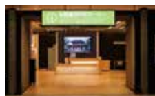
<Japanese Prefectural Tourism Promotion Corner >