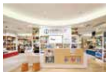
Tama (Ecute Tachikawa)