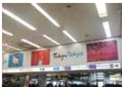
In the city