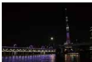
Sumida River Bridge (Tobu Railway)