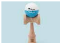
Sales of Tokyo-branded souvenirs