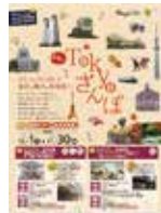
Walking tour pamphlet