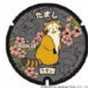
Design manhole cover