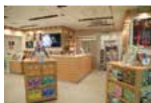
Keisei Ueno Station