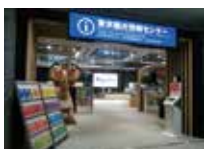
Tokyo Metropolitan Government Main Building