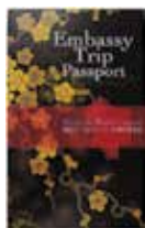
Embassy stamp rally World Carnival (Minato Travel & Tourism Association)

<Example of specialty product development support>