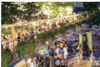
<Depiction of a nightlife event>