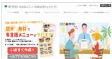
Examples of Multilingual Menus