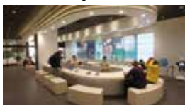
Shinjuku Expressway Bus Terminal (Busta Shinjuku)