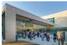
<Showcase events (Sample)>