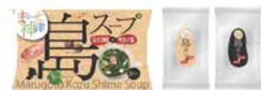
Development of "Shima Soup" (Kozushima Tourism Association)

<Example of specialty product development support>