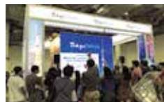
Travel expo booth