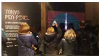
Marketing event (Paris)

Individuals or companies that conduct local marketing by offering the latest information on Tokyo to local travel companies and media, conducting sales activities and promoting Tokyo tourism to the general public.