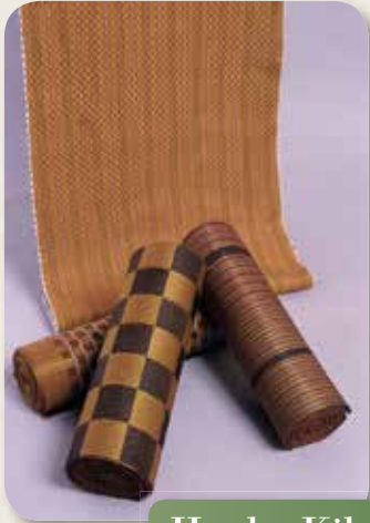
Honba Kihachijo (Hachijojima Silk Fabric)