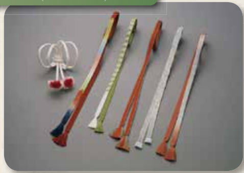
Tokyo Kumihimo (Braided Cords)