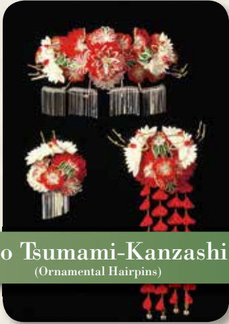
Edo Tsumami-Kanzashi (Ornamental Hairpins)