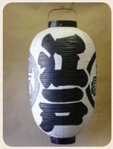
Edo Tegaki Chochin (Hand-Painted Paper Lanterns)