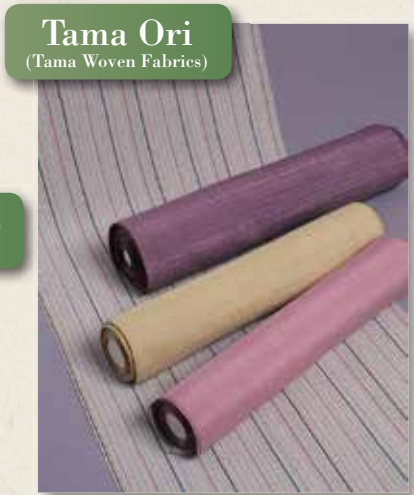
Tama Ori (Tama Woven Fabrics)