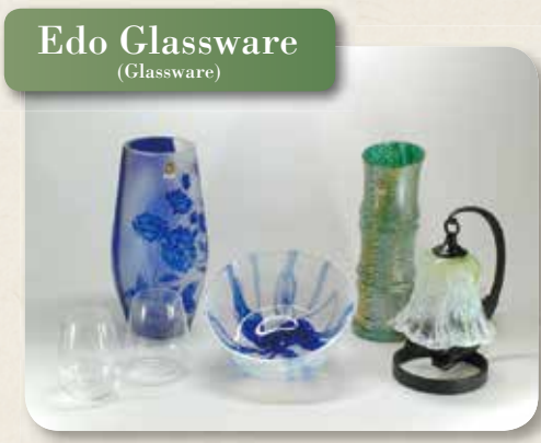
Edo Glassware (Glassware)

Over many years, traditional crafts of Tokyo have been nurtured by local natural environment and history. They are the products of traditional techniques and methods that have lasted through generations. At present, 40 separate items have earned designation as traditional crafts of Tokyo. [Tokyo Traditional Crafts website] http://www.sangyo-rodo.metro.tokyo.jp/shoko/dentokogei/english/