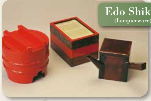
Edo Shikki (Lacquerware)